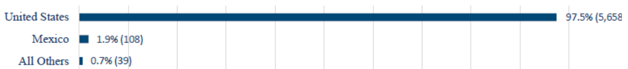
Figure CFT-03a: Defendants by Citizenship, 2017 – 2021

Citizenship was identified for nearly 100% (5,805 of 5,826) of the defendants. Figure CFT-03a presents the number and percentage of defendants by their citizenship. U.S. citizen defendants accounted for more than 97% of all defendants. Among the 108 defendants that were citizens of Mexico, 87% (94) were involved in cases in the Southwest region.